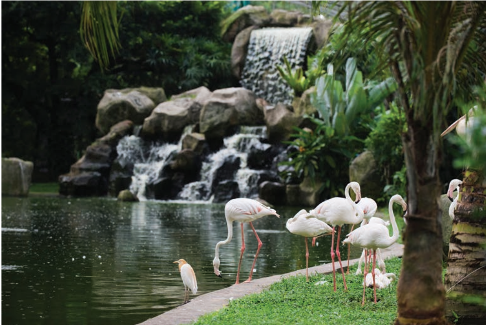
Fig. 2.1 for Question 2